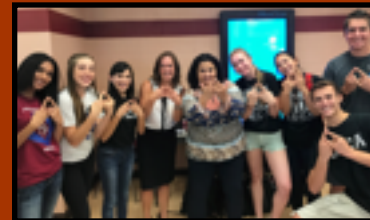
Picture: All DECA Meeting with Homeward