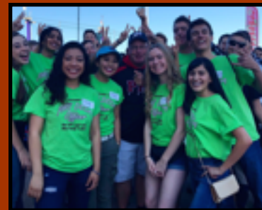
Picture: Kiwanis Day At The Fair